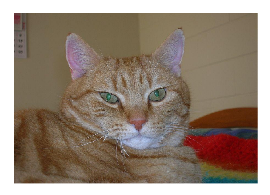
Fig. #B1: My beloved companion and four-legged friend named Teecee. Please take the notice of his sad eyes - in which the foreseeing of death is visible. In spite of his small sizes, his meaning in my life was equally huge as his loving heart. It was this humble Teecee that managed to teach me so much about the love, and about the appreciating the value and fragility of life. I am unable to describe the sadness, grief and the feeling of tragedy which fill me from the time when Teecee was murdered so brutally by barbaric relatives of humanity. My entire world got shattered into small pieces at the moment of his death. My heart is overflowing with the pain which I am unable to even express. Teecee, I never forget you and you will always remain in my heart and my memory.