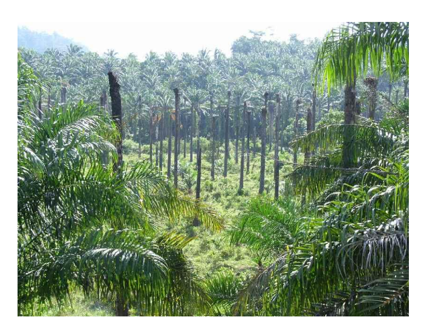
Fig. #F2: The photograph of a section of "oil palm" plantation in the Malaysian jungle, on which clearly visible are remains of simultaneously died oil palms from a noticeable proportion of this plantation. This is because all oil palms born in a given year, synchronise precisely their dying and always they die in exactly the same time. I took the above photograph on 2 September 2010 near the place called "Nilai" - south of Kuala Lumpur. (Click on the above photograph to see it enlarged or to shift

The supernatural capabilities of many species of animals and plants are elaborated in more details in "part #F" from the totaliztic web page<u>stawczyk_uk.htm</u>, as well as in items #D1 and #D2 of the web page <u>fruit.htm</u>.