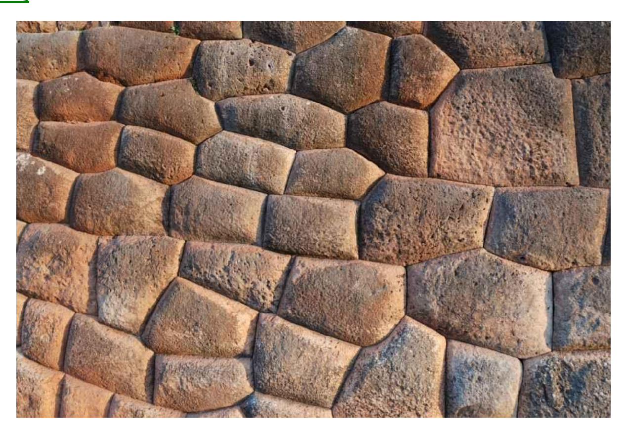
Fig. #I1 : Here is an "engineering proof" for the existence of God, and for the fact of creation by God of various megalithic structures at the time when the Earth was created. This "engineering proof" boils down to such a high precision of mutual fitting of curvatures of stones that form the above "Inca Wall" (and also stones which form many other similar ancient walls from Peru), that the human technology neither today, nor even in near future, is able to build such a wall. (Click on the above photograph to see it enlarged.)

The topic of intentional inspiring people by God to creative searches for truth (via creating on the Earth by God various controversial structures and forms with the level of accuracy that exceeds the present level of human science and technology), is also discussed in items #H1 and #H2 of the web page named <a href="mailto:god_exists.htm">god_exists.htm</a>, as well as in subsection A10.1 from volume 1 of <a href="mailto:monograph">monograph</a>[1/5].