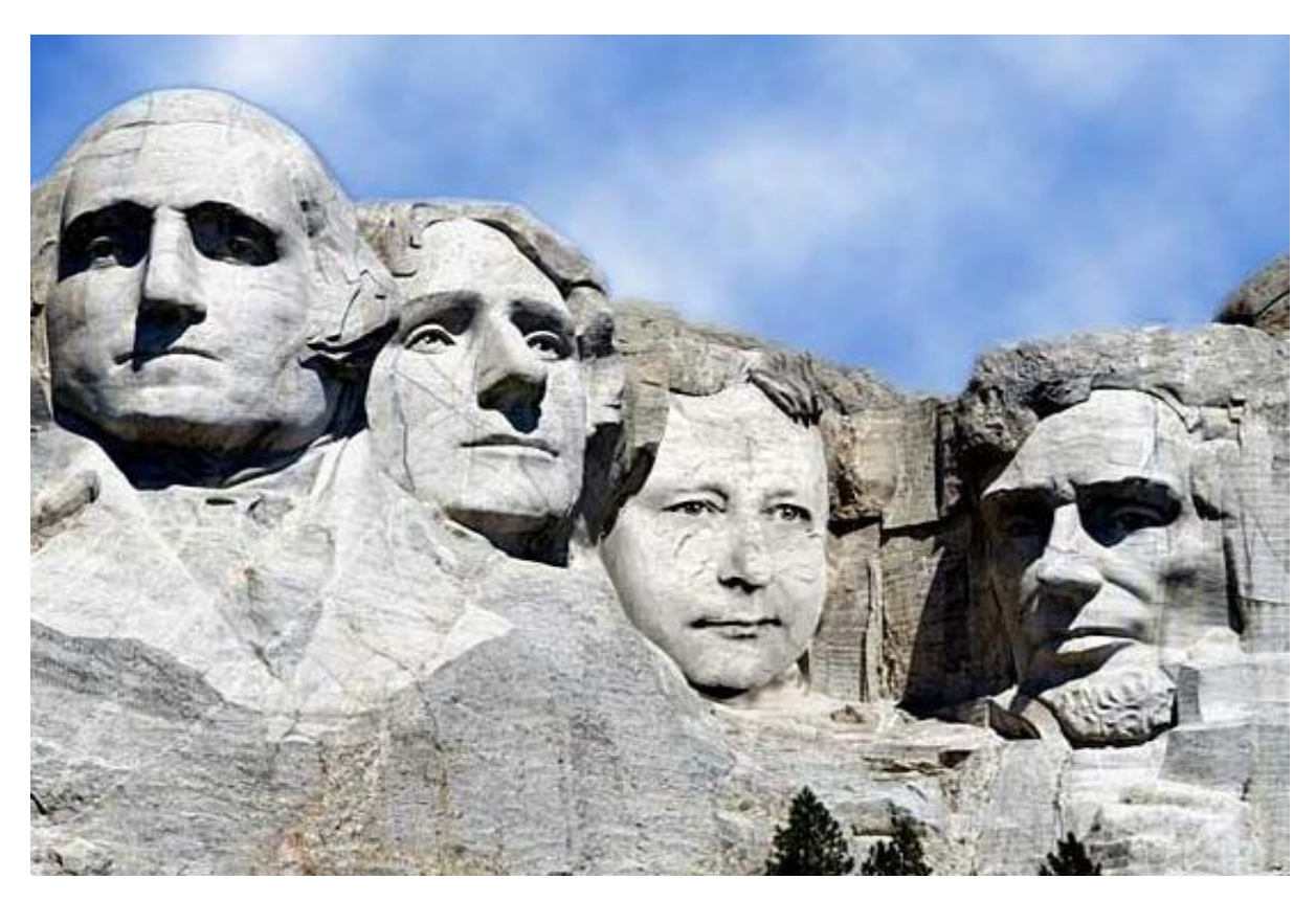
Fig. #J3: NO, this is not at all the natural human figure which supposedly is visible from the river Rhine. The reader probably met already in internet the above sarcastic joke of my sworn enemies - if NOT then I should explain here what this joke is about. Namely, some amongst sworn adversaries of totalizm laboriously composed my photograph as the third president above, thus making an allusion to the political party of totalizm which I tried to form in past. After all, originally this photograph shows the 18-metres high so-called "Mt Rushmore National Monument" from South Dakota, USA, which immortalises four most prominent leaders (presidents) of the USA carved in a granite hill slope, i.e.: Theodore Roosevelt, Thomas Jefferson, George Washington, and Abraham Lincoln. But my hidden enemies obviously see this slope completely different. The reason why I show this sculpture here is to illustrate how this natural human figure visible from the river Rhine really looks like. This is because the appearance of it is very similar to figures from the above illustration. Only that it shows a single man in the frontal view, and that a whole person is visible on it, including legs and feet, not just a part of a human. In turn such an exact and so clear natural picture of a human, visible from the water of the Rhine river, can be accepted as another one amongst numerous items of evidence that God

evidence which is to generate the certainty that God does exist, such someone would firstly need to put into finding this relief a considerable effort and labour to overcome the "barrier of awareness" which is described by the doubt "whether this natural relief in fact does exist and whether it originates naturally from the creative work of God". Only if someone would overcome this "barrier of awareness" and climbed to the appropriate "level of induction into the knowledge" that would give him the certainty of the existence and natural origins of this relief, it could generate in him the cognitive certainty that God really does exist.