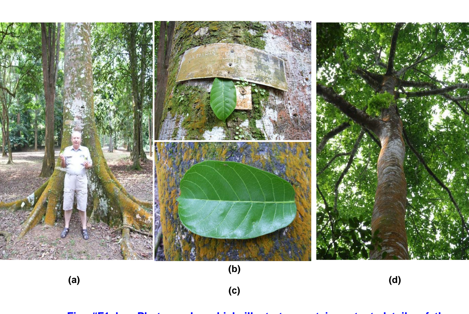
Fig. #F1abc: Photographs which illustrate most important details of the appearance of the famous Ipoh tree. It is from soap of this tree that the deadly poison "curare" is produced. But this tree is NOT so popular in tropical jungles. In order to find it one needs to put a lot of effort and searches. The above specie I found and photographed in a kind of well kept park which guaranteed a perfect visibility of it, thus also good conditions for photographing. The park is located in the "Forest Research Institute Malaysia (FRIM)", 52109 Kepong, Selangor Darul Ehsan, Malaysia; <a href="frim.gov.my">frim.gov.my</a>. (Click on a given photograph to see it enlarged.)

Fig. #F1a (left): Myself, means Dr Eng. Jan Pajak, by the trunk of the Ipoh tree. Photographed on 12 August 2008. As one can see the tree is huge and looks typical - i.e. almost like every other topical tree. In order to produce curare from it, one needs to cut bark on such a tree trunk, and then collect the poisonous soap which comes out from under the bark. Just above my right ear one can see an inventory tag with the description of the tree, the enlargement of which is shown in part (b) of this Figure. Notice the cleanness, care, and good visibility of the park in which the tree shown above is grown. Only because of this good visibility it was possible to photograph the tree. A typical tropical bush does NOT look like that. Such a jungle is usually so dense that trees become visible in it only when one almost can touch them - means when one approaches them at a distance of less than 1 meter. Of course, in such a natural jungle it is impossible to photograph and to show all details of the tree, e.g. its canopy, as this is accomplished on the above photographs.