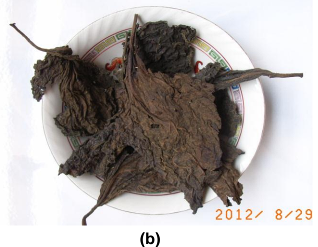
Fig. #F5ab: Acalypha Wikesiana v. Marginata family Euphorbiaceae or rather Clerodendrum Philippinum? But for sure it is the "fertility herb" effectively treating female infertility. Its official name was NOT yet identified - so it seems that the author of this web page accidentally hit upon the herb which still remains unknown to the old "atheistic orthodox science" (i.e. to the careless, lazy and monopolistic science which is described and defined in items #C1 to #C4 from the web page named telekinetics.htm), and thus the author opened for the use by our civilisation the herb discovered for the first time by the new "totaliztic science". The past performance during the use of this herb seems to suggest, that about 87% of infertile women taking this herb (i.e. 7 out of every 8 taking), are getting pregnant naturally within NO later than one year since taking the drug. (In the other, the 8th amongst these women, probably the cause of infertility lies with her partner). The "herbal medicine" made from this herb (i.e. the one shown in part "b") is provided free of charge to known in person by the healer couples or