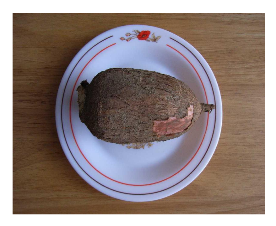
Fig. #B1a: An example of a single root of tapioca. In Chinese such a root is called "mook si" what literally can be translated as "wood", "piece of wood", or "wooden tree". In turn Malays call it "ubi kayu" what literally can be translated as "wood potato". A soup boiled from such roots is an excellent remedy for ceasing diarrhoeas (the best I know so-far out of such remedies). In turn dried, powdered inner part of such a root is a quality "Tapioca Starch".

Please notice that healing properties of tapioca are described also on the web page tropical fruits , and briefly mentioned also on the web page Wszewilki .