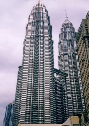
Fig. #2c (C3 in [10]): Here is the appearance of these famous KLCC.By the way, KLCC is one of technical wonders of the present world. Therefore, if you already are in Kuala Lumpur, or somewhere near to it, I would strongly recommend to visit it and to see it with your own eyes.