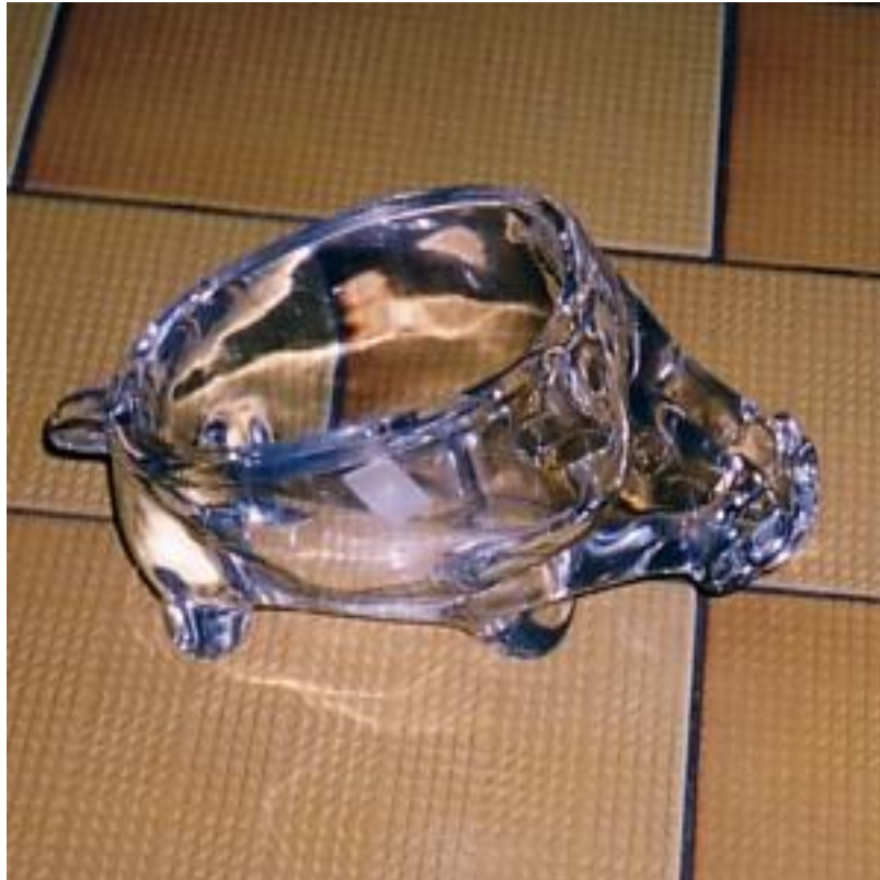
Fig. #D5: A crystal flower pot made in the shape of a wild boar.

Nothing else enhances beauty as well as pigs do. Thus the a good combination can be that of pigs and flowers. Notice also old saying about "casting pearls amongst pigs".