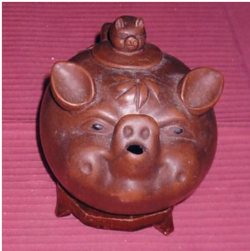
Fig. #D1: An antique ceremonial teapot. In old days it was used for tea ceremonies, when a person born under the sign of the pig was paying respect to family elders.

the form of a ritual dance. Of course, pigs are also used for various ceremonies not only in China. For example, in Papua New Guinea pigs are slaughtered ceremonially to celebrate all type of events. In some old religions pigs were also used as offerings to gods.