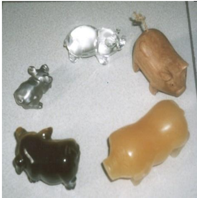
Fig. #B3: The order of 5 elements used in the Chinese (animal) birth zodiac. These include (counting clockwise starting from the top): water, wood, fire, earth, metal (then again water, etc.). Each element prevails for 2 years, then it is replaced by a next element from the above list.

Years 2000 and 2001 were metal years. This means that their events were dominated by metal. Years 2002 and 2003 were water years. This means that their events were dominated by water. Years 2004 and 2005 were wood years. This means that their events were dominated by the wood element. Years 2006 and 2007 were fire years. This means that the majority of events which affect humans in these two years were dominated by the fire element. In turn years 2008 and 2009 are earth years. This means that the majority of events which affect humans in these two years are to be dominated by the earth element. Years 2010 and 2011 will again be metal years. This means that the majority of events which affect humans in these two years will be dominated by the metal element (not very optimistic prospect, considering what usually happens in years dominated by metal).