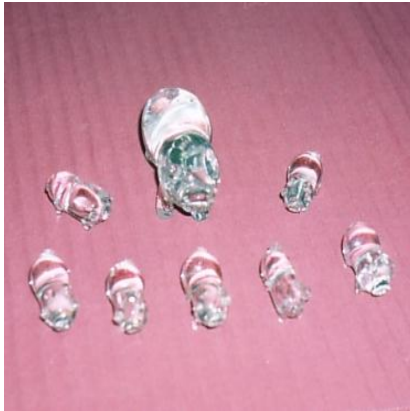
Fig. #A2: A family of crystal pigs. Perhaps they represent our last reincarnation into animals, before we become humans!