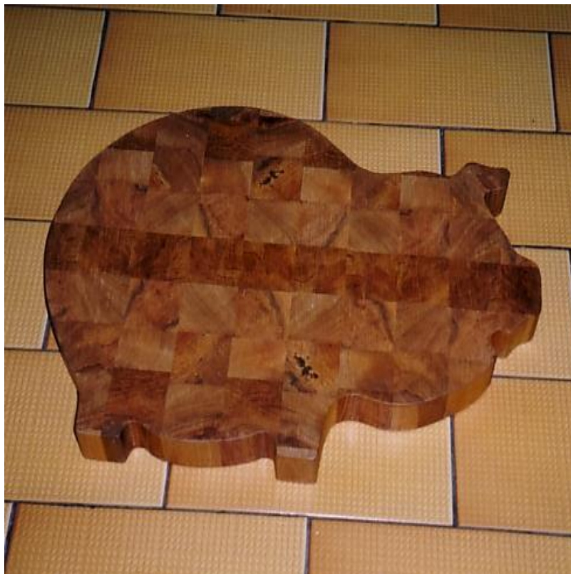
Fig. #D8: A kitchen cutting board made in the shape of a pig (Rimu tree timber, New Zealand).