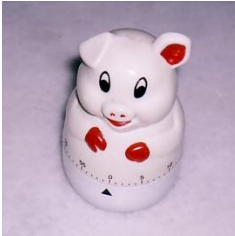
Fig. #D3: An egg cooking clock made in the shape of a pig.