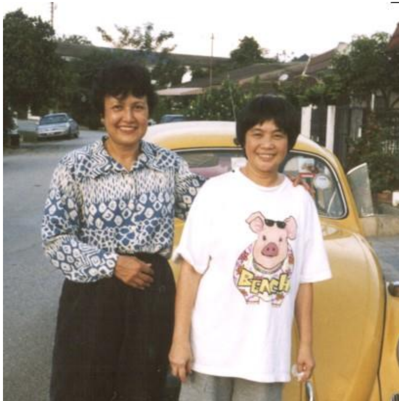
Fig. #F2: One of these charming ladies is the shy owner of the collection of ornamental pigs partially shown on this web site. I wonder whether the reader manages to guess which one.

#F3. On a separate web page Pigs Photos more ornamental pigs from this collection is shown: