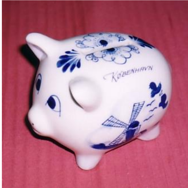
Fig. #D7: An ornamental piggy-bank made of china.

E.g. you can cast them out of gold or diamonds. Thus as collectables can accommodate your wealth.