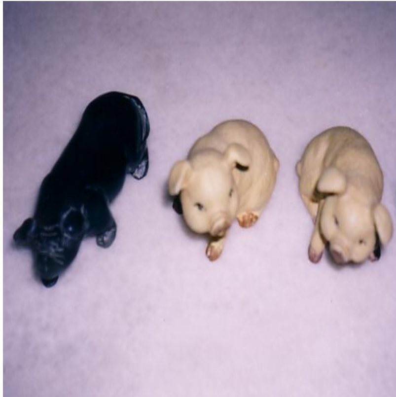
Fig. #D2: Examples of collectable pigs.

which we are born. I recommend to start them as soon as possible - your friends and family members are eager to buy them for you!