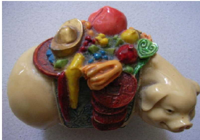
Fig. #E4: Here is a close-up of the "fortune pig" shown also in "Fig. #D6". This close-up was taken in order to show in it the Chinese symbol of power, authority, and perfection, means the official seal with outlines of a "spiral" inside. This seal in the above pig takes a form of a green ellipsis, clearly visible on the upper side of the neck of this "pig of fortune". On this seal one should be able to see outlines of two counter-rotating spirals joined together by their loose ends - so that they form a shape similar to a heart. (Click on the above photograph to see it enlarged.)