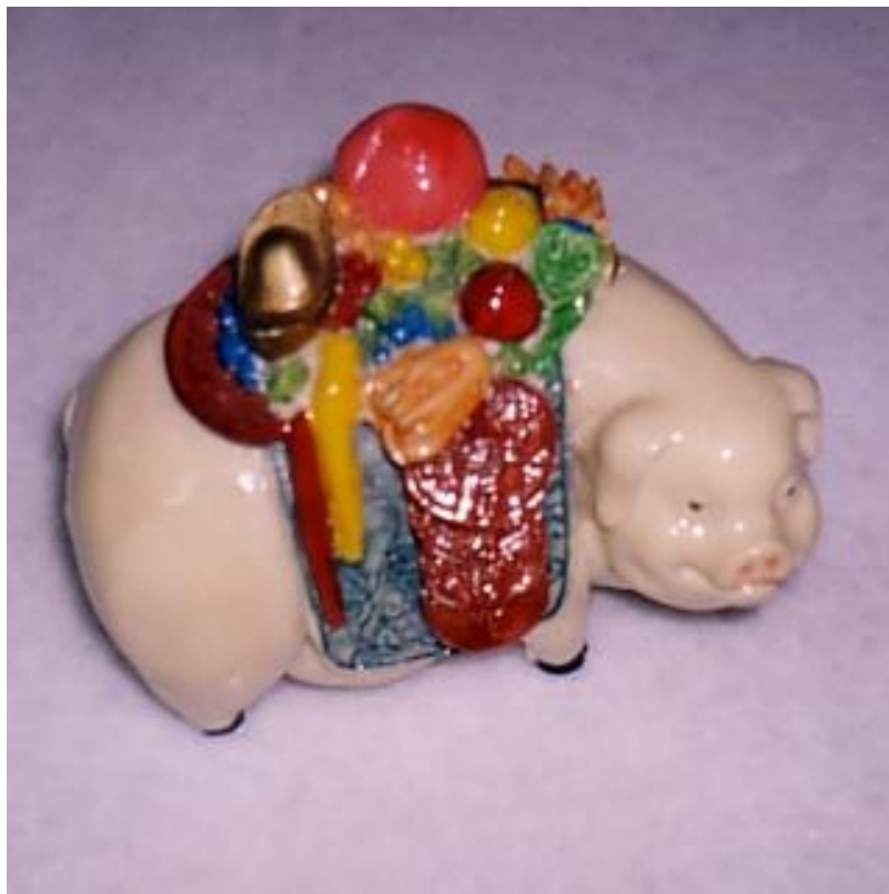
Fig. #D6: A Chinese "good luck pig" (also called "fortune pig"). It bears insignia of all wishes and attributes important to Chinese people. Notice the symbol of wealth shaped like Chinese money (i.e. Chinese money look like small boats made of gold), a symbol of longevity (i.e. a special type of peach), a symbol of official power (i.e. an official seal), and also a symbol of vitality and health (i.e. horns of a deer). The pig itself is also a symbol of fertility, as it is a female one and well endowed.